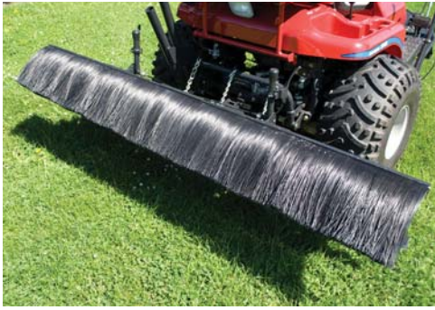
◀ Left Brush