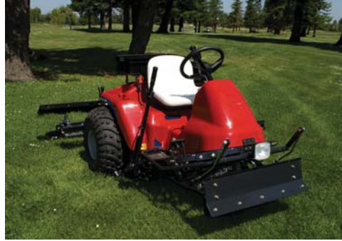
▲ Above Baroness Bunker Rake SP05