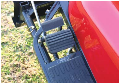
▲ Above The foot operated brake ensures safety by not allowing the vehicle's engine to start unless the operator is seated and the brake is engaged.