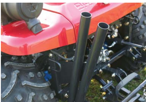
▲ Above Easy maintenance. ◀ Left Rake storage. ▶ Right Change box and cup holder.