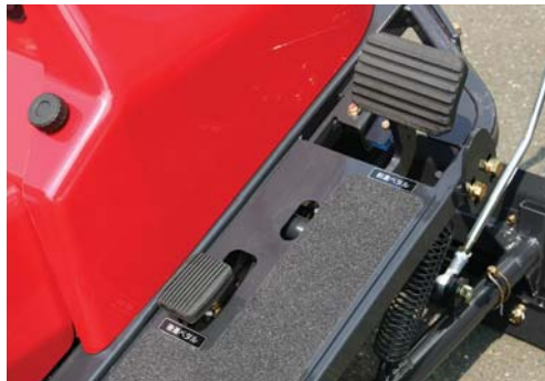
▼ Below The traveling pedal is designed to keep the foot comfortable even after hours of use.