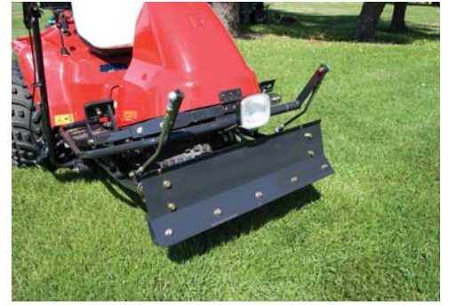
▲ Above Front Blade