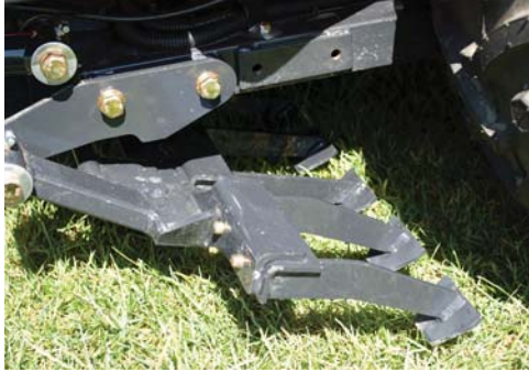
▲ Above Cultivator