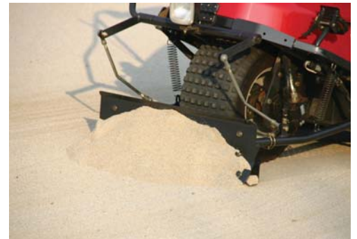
▼ Below SP05 offers three optional attachments—front blade, cultivator, and brush.