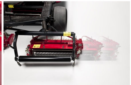
Step 1 - unclip the drive cable